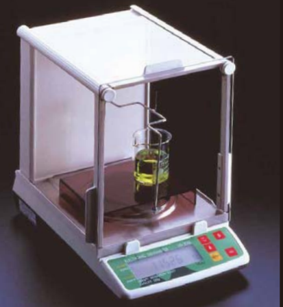
Liquid Density (Option)