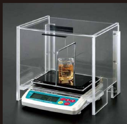
Liquid Density (Option)